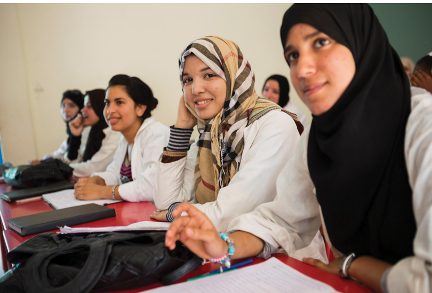
Students study in Agadir, Morocco.

A successful effort to adapt and scale up strategies to address the four key NCD risk behaviors among young people will require collaboration and coordination across multiple sectors as well as involvement of young people themselves. Filling the critical information gaps with frequent, comprehensive surveillance of risk factors as well as rigorous monitoring and evaluation of policies and programs is also essential for identifying the most effective and sustainable interventions for the countries in the region. Investing in the health of the young is essential for building the foundation of the countries' future. Helping youth avert the premature onset of NCDs and enabling them to reach their full potential will decrease health care costs and enable them to more fully contribute to national growth and vitality. Today's actions for youth will set MENA countries on a path toward continued economic growth and prosperity.