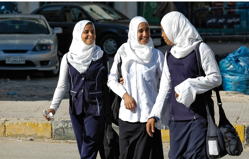
Students in Egypt walk home from school.

While many countries in the region are fighting high rates of obesity, others are facing the double burden of both increasing overweight and obesity on one hand, and persistent undernutrition on the other. Among 13-to-15-year-old boys in secondary school, 12 percent in Yemen in 2014 and 13 percent in Morocco in 2010 were overweight or obese, while 18 percent and 11 percent were underweight, respectively.