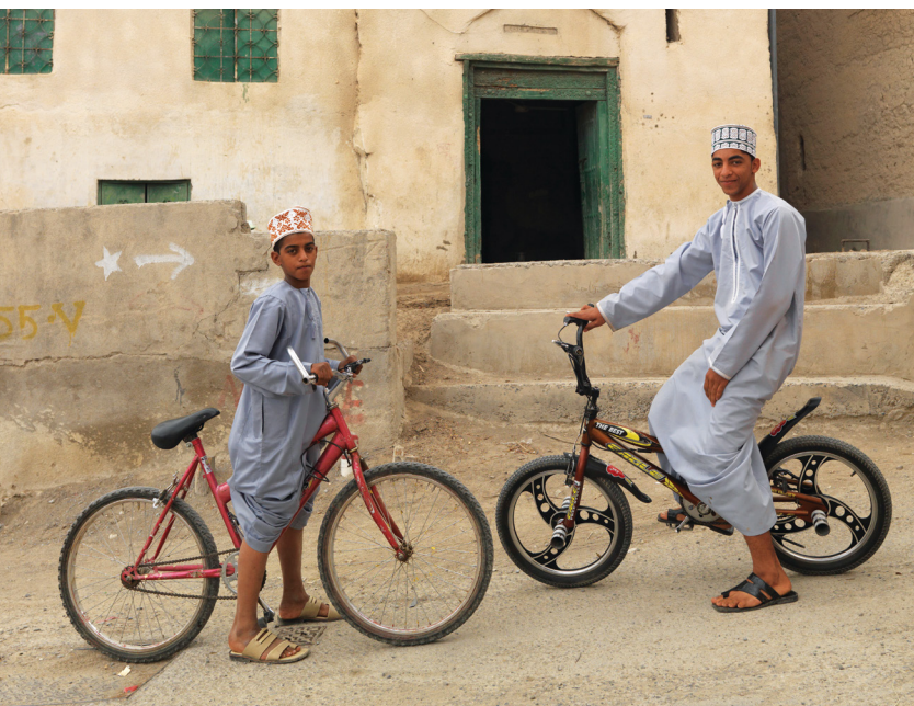
Boys ride bicycles in Nizwa, Oman.

Successful implementation requires strong public and political commitment, multisectoral collaboration, strengthening of regulatory capacity, and coordination among responsible entities. The challenge does not fall to any single entity, but by collaborating across sectors on various risk-reduction strategies, multiple groups can create a powerful approach to support the health of young people and lower future costs. More intervention studies and rigorous evaluations of existing policies and programs in the region are necessary to understand what works in what contexts and which approaches are most cost-effective and sustainable. For example, many evaluations of diet or physical activity programs among young people have been unable to assess whether changes in behaviors were sustained, or whether they led to physiological outcomes such as reductions in weight. By expanding the evidence base in the region and drawing on global evidence, policymakers can have access to a growing number of best practices and effective interventions for addressing NCD risk behaviors among young people in the region.