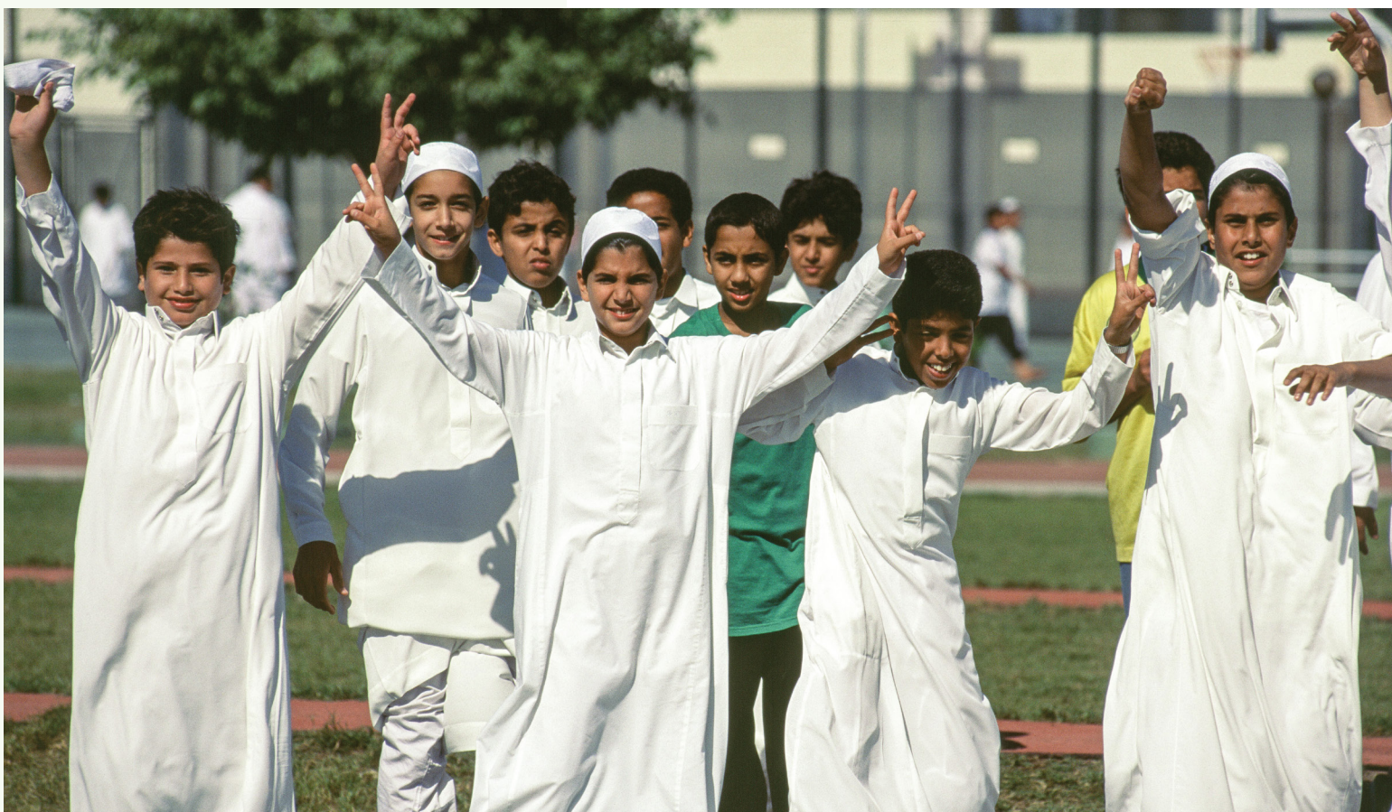
Students play in Khobar, Saudi Arabia.

Up-to-date data on young people’s risk behaviors and associated factors are essential for identifying needs and developing appropriate responses to combating them. Data availability, however, varies substantially across countries in the region. Data sources include country-specific, national, or subnational surveys; global or regional school-based surveys such as the Global School-Based Student Health Survey and the Arab Teens Lifestyle Study; and global household surveys such as the Demographic and Health Survey and the survey for the WHO STEPwise Approach to NCD Risk Factor Surveillance. Data from these surveys are valuable and are often the only information on the young people available for decisionmaking. Many important challenges remain. Some of the surveys listed above have not been repeated in recent years and the data on risk behaviors may be out of date. For example, of the 16 countries that have ever conducted the