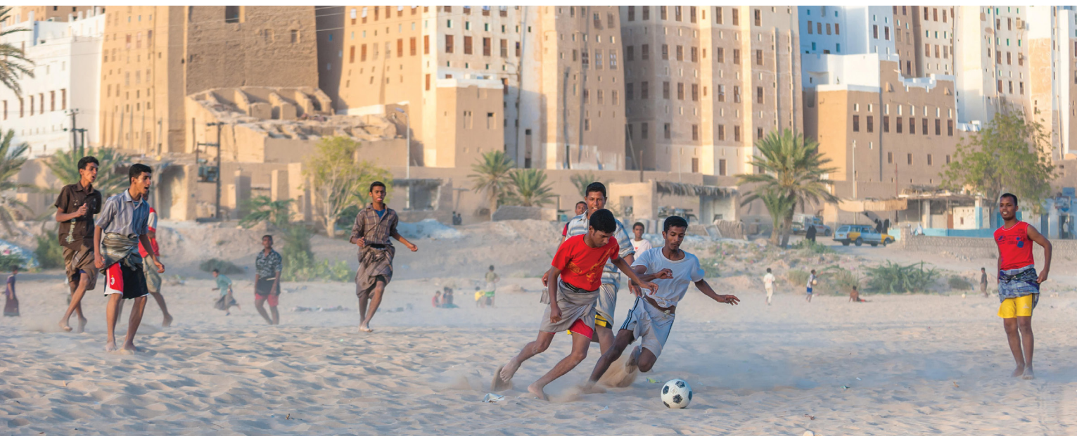
Young men play soccer in Shibam, Yemen.

NCD prevention among young people also aligns with the targets of the WHO Global Action Plan for the Prevention and Control of Noncommunicable Diseases 2013-2020 and the United Nations (UN) Sustainable Development Goals (SDGs). Both initiatives aim to reduce premature NCD deaths by one-third by 2030. Because the countries across MENA