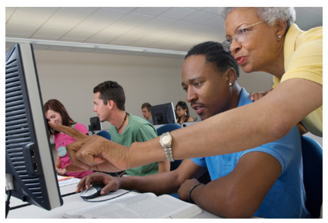
Older workers with complex jobs were most able to preserve their cognitive performance in the face of Alzheimer's-related brain changes.

Education may directly affect brain development by creating stronger connections among brain cells that older adults can draw upon if their memory or reasoning ability begins to decline.