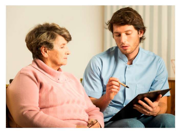
A variety of studies link obesity in midlife to lower cognitive function and increased dementia risk in old age. But obesity after age 65 appears to provide some protection from dementia.

To explain the relationship between midlife body fat and later life mental function, a number of researchers say we should look to childhood. Preliminary analysis by Herd and Dowd (2016) suggests that midlife obesity and late-life cognitive function are both "a function of early life factors." They show that the link between midlife obesity and mental decline can be explained when childhood characteristics are taken into account-parental socioeconomic status, adolescent IQ, and educational attainment (factors that tend to be interrelated). These childhood factors influence both obesity and cognitive function later in life, they argue. Their findings are based on data from the Wisconsin Longitudinal Study, which has tracked a cohort of predominantly white high school graduates for 60 years.