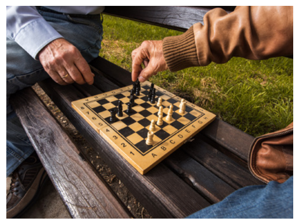
Researchers are investigating the complex relationships among education, intellectual stimulation, brain development, and cognitive health in old age.

Late-life mental training also appears to contribute to better cognitive function. Findings from the Advanced Cognitive Training for Independent and Vital Elderly (ACTIVE) study show that certain kinds of cognitive training in older people can improve or maintain function in tests administered as part of the study, with some of the training benefits evident even a decade later (Rebok et al. 2014). More than 2,800 healthy adults ages 65 and older participated in 10 training sessions to strengthen