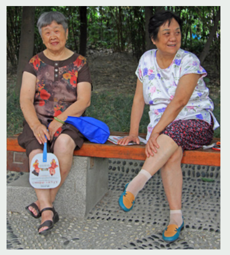
In low- and middle-income countries today, dementia risk among older adults is shaped by the amount of schooling they received during youth, particularly for females.

While dementia affects a greater share of people in high-income countries, the total numbers of people with dementia are rising most rapidly in many low- and middle-income countries, according to estimates from the Global Burden of Disease (GBD) 2013 Collaborators (University of Washington, Institute for Health Metrics and Evaluation 2015). The GBD research—designed to address underestimates due to misclassification of causes of death—finds dementia caused more than 10 percent of all 2013 deaths in the United States and a number of other high-income countries, including Finland, Italy, Iceland, Switzerland, and Canada. But low- and middle-income countries saw the largest relative increases in dementia-related deaths. Between 1990 and 2013, the