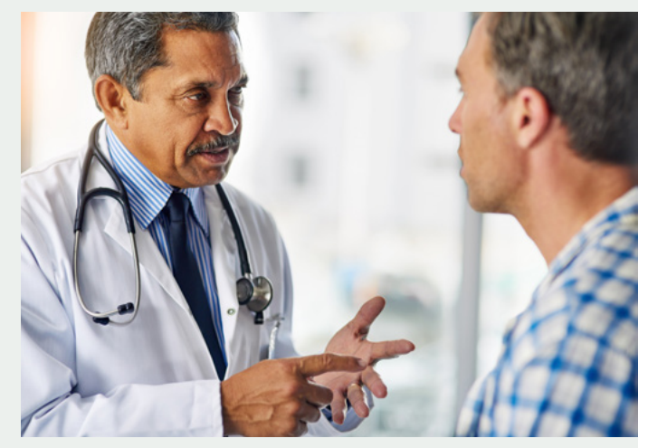
New treatments and approaches that prevent or delay dementia could lead to fewer dementia cases and lower health care spending.

Dementia care is time intensive. Using data from the 2011 National Health and Aging Trends Study, Kasper, Freedman, and Spillman (2014) calculated unpaid hours of help to persons ages 65 and older receiving assistance in settings other than nursing homes. They found that unpaid hours of help to persons with probable dementia were more than double those to persons with no dementia (221