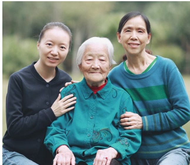
Rising education and better medical care have improved health, reduced gender gaps in health at older ages, and increased life expectancy.

Rising obesity rates and high smoking prevalence (among men) also present major health challenges for China's aging population. In 2011, 28% of men and 38% of women ages 45 and older were overweight, putting them at higher risk of heart disorders, hypertension, diabetes, and stroke. 8 Over half of men ages 45 and older (53%) smoked in 2011, compared with 5% of women in that age group. 9 High levels of pollution—especially in urban areas—pose additional health risks.