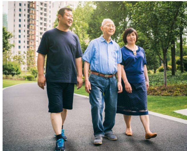
Rapid urbanization has isolated millions of older adults from adult children who have traditionally provided caregiving support.

is largely explained by lifestyle factors such as lower levels of physical activity, according to a recent analysis of CHARLS data by Yuan Zhang and Eileen Crimmins. 24 Another study of Chinese adults ages 65 and older, based on CHARLS data, showed that living in urban areas later in life is associated with better initial cognitive status but a faster rate of cognitive decline. 25 The researchers argue that faster cognitive decline in cities may be linked to higher levels of population density and “constricted life space,” high housing costs, and the high cost of food and health services, among other factors.